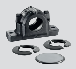
SNC pillow block + 2 DS double lip seals + plug